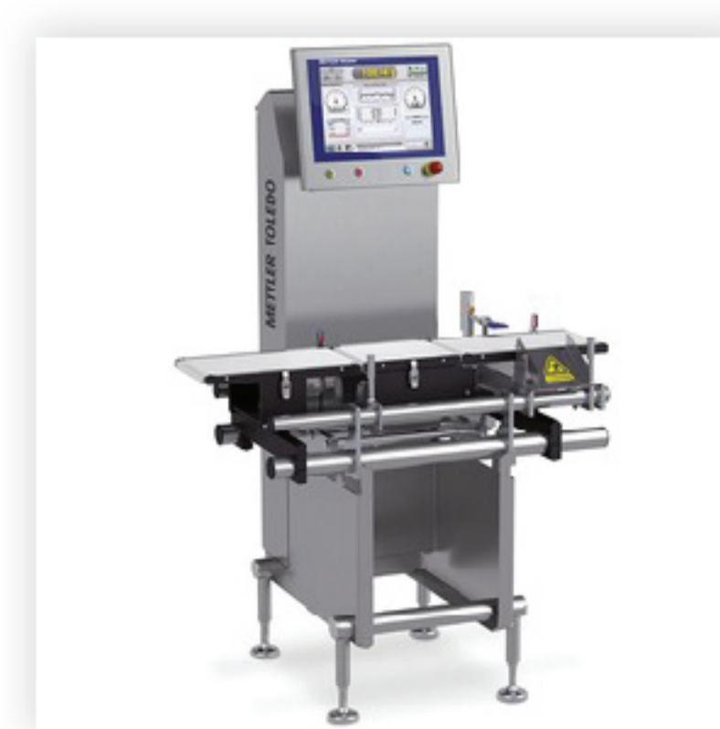
Check Weigher With Air Blower