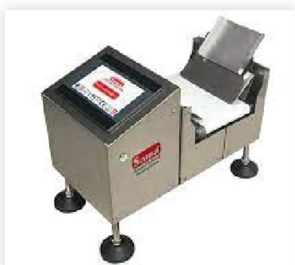
Mini Check Weigher

The dynamic check-weigher can help reject unqualified products from the production line when their weight is out of tolerance.